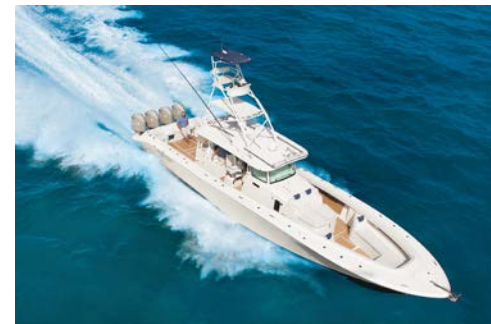
Hydrasports 53 Custom