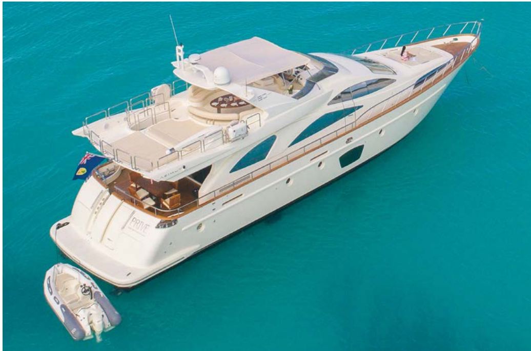
Azimut 80 Luxury Motor Yacht