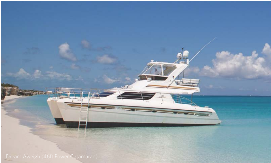
Dream Aweigh (46ft Power Catamaran)