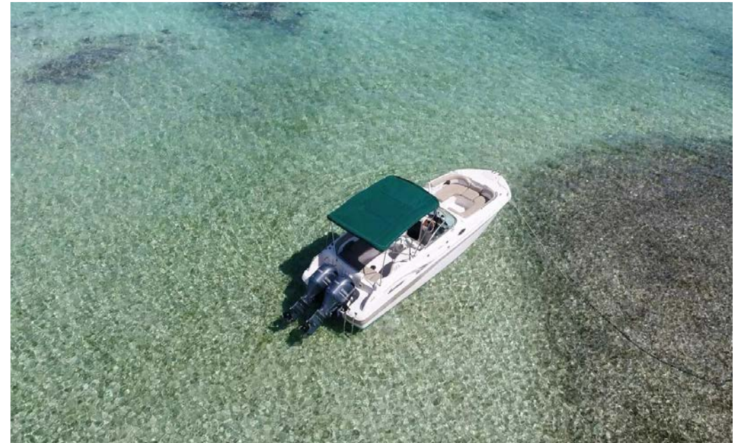
Vessel: 26ft Hurricane

What better way to reveal the beauty of the island than by boat? Taking to the water on a private charter, you'll explore hidden coves, cruising through the warm sea breeze with a Captain at the helm to ensure every aspect of your adventure is completely seamless. Please contact the Amanyara team for more details and prices.