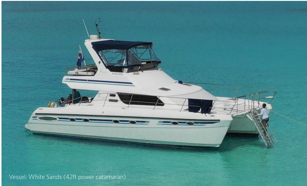
Vessel: White Sands (42ft power catamaran)