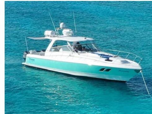
Vessel: Serenity (47ft Intrepid 475 Yacht)