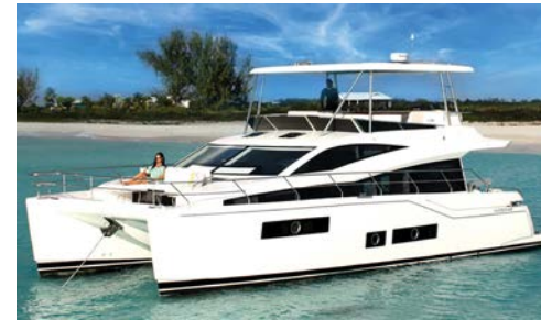
Purra Vida HPC Power Catamaran