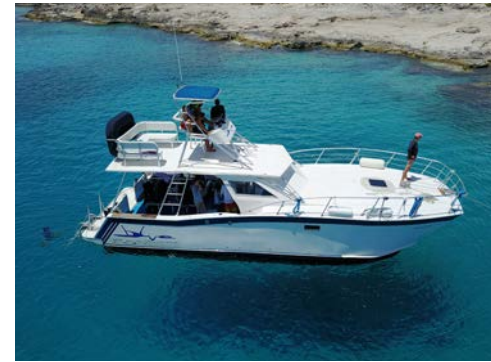
Live & Direct (40ft power catamaran)

All trips with Big Blue include homemade sweet and savory snacks, alcoholic beverages and lunch for full day charters. Whale watching trips are also available from January to March.