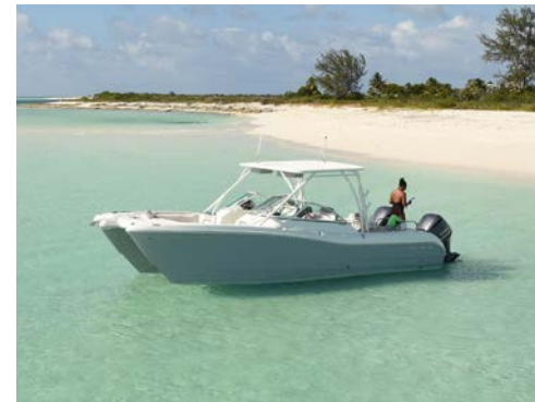
Vessel: Little Chill & Lady T (2 x dual console twin 300HP Yamaha World Cats)