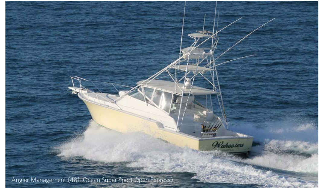
Angler Management (48ft Ocean Super Sport Open Express)

Private sunset dinners include a 3-course meal with fresh lobster (when in season), champagne, wine and a choice of premium drinks.